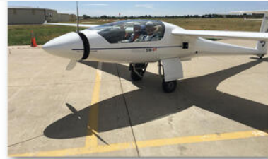
N5121 Idling (prop distorted by camera)