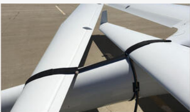
N5121 Wings Folded for Taxi/Tie-Down